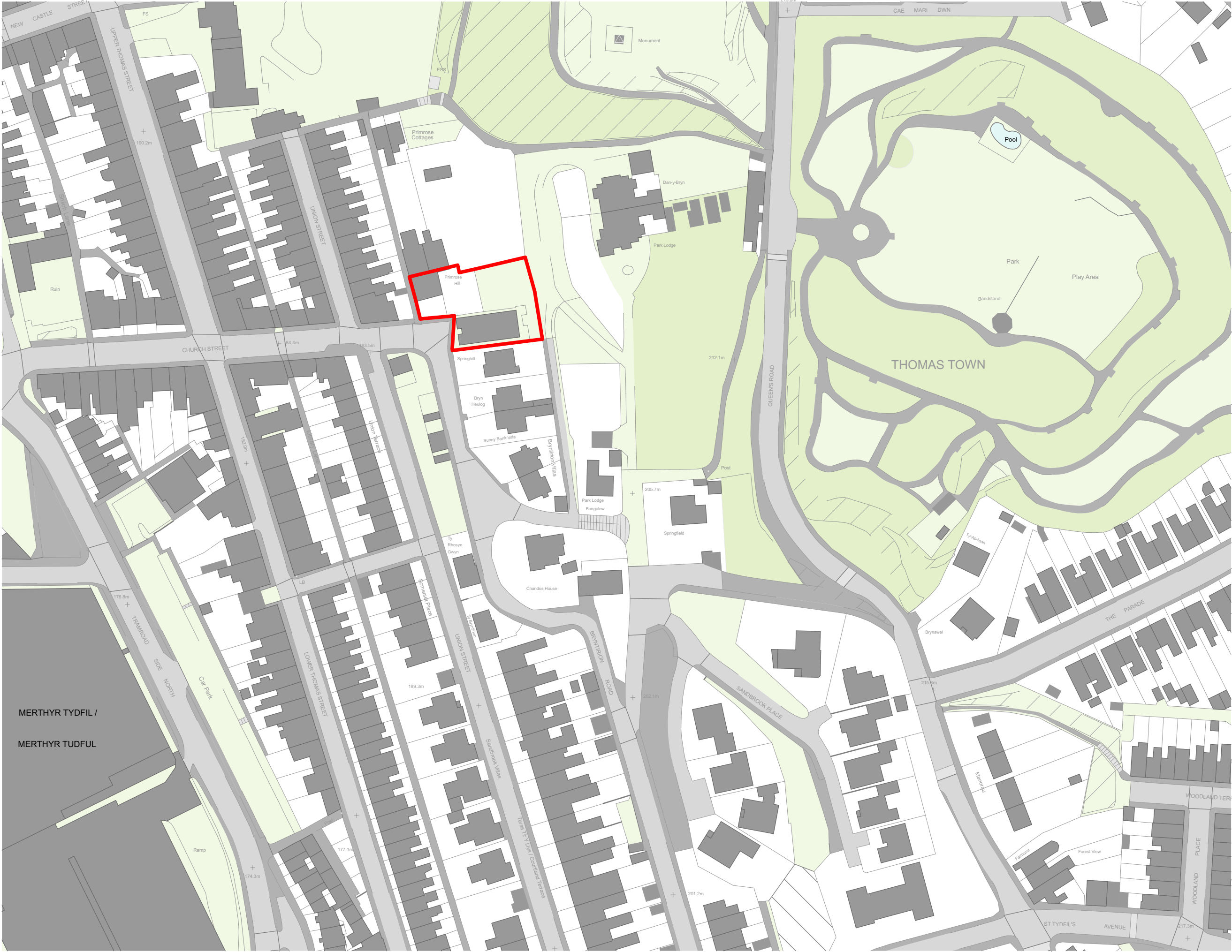
Site Location Plan 1:1250@A3

This drawing is the property of GWP Architecture. Copyright is reserved by them and the drawing is issued on the condition that it is not copied, reproduced, retained, or disclosed to any unauthorised person, either wholly or in part, without the consent in writing of GWP Architecture. All drawings and specifications should be read in conjunction with the project health and safety plan, any possible conflicts should be presented to the Planning Coordinator. All work to be carried out in accordance with current Building Regulations. Contractors must verify all dimensions at the job before commencing any work or making shop drawings. Written dimensions should be taken. Do not scale off drawing. Do not take digital dimensions from this drawing. Any discrepancies to be reported to the Architect.