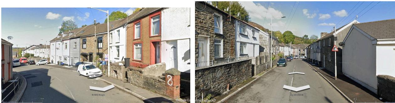
Photos in vicinity of 6 Cardiff Street