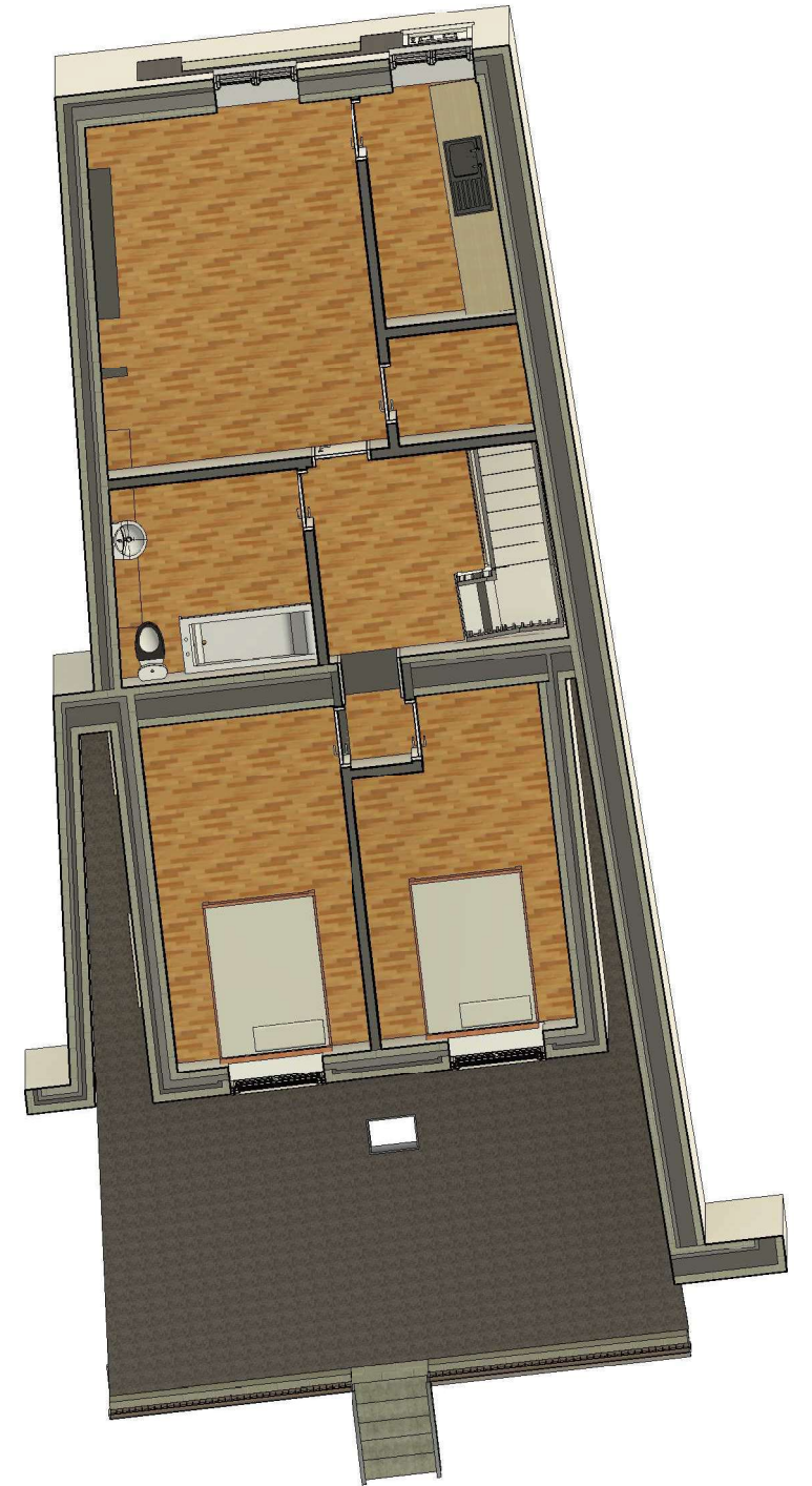
3 Proposed Second Floor