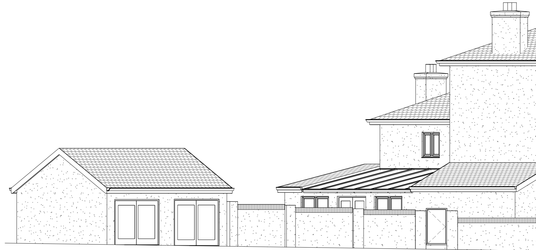
1 Existing Street Scene 1 : 100