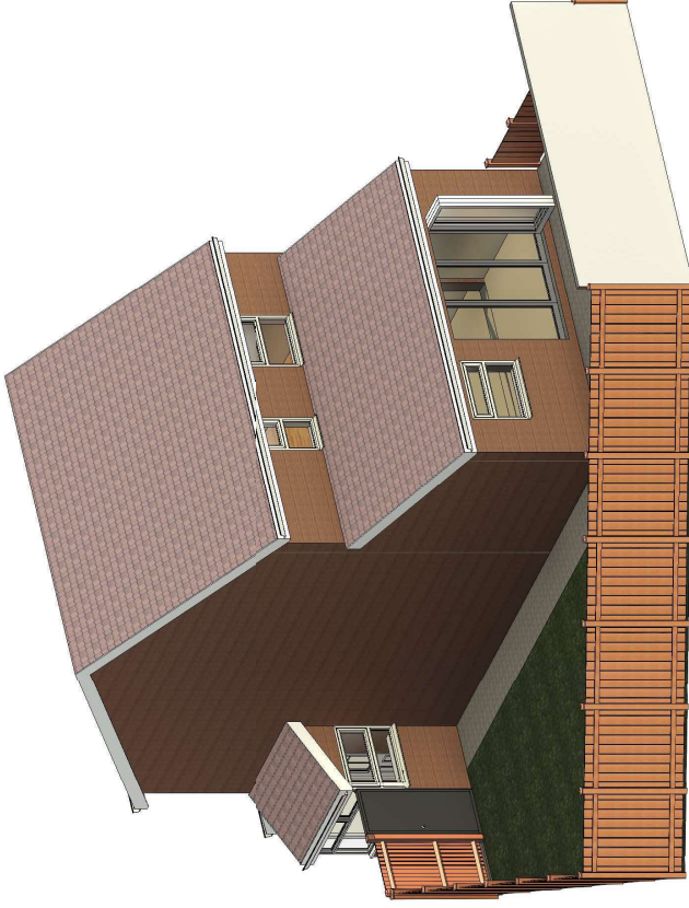
2 Proposed Illustration A