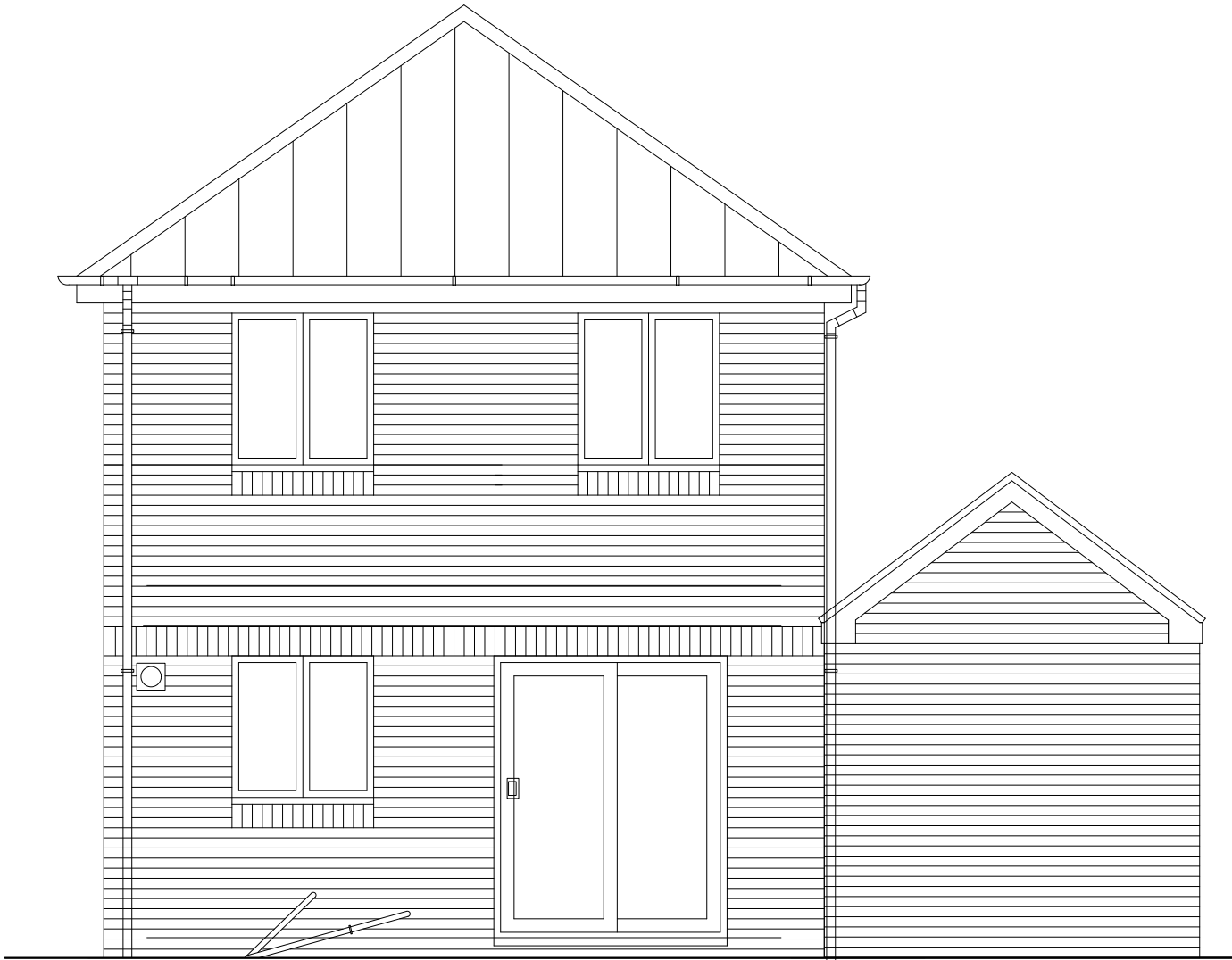
Existing Elevations Rear