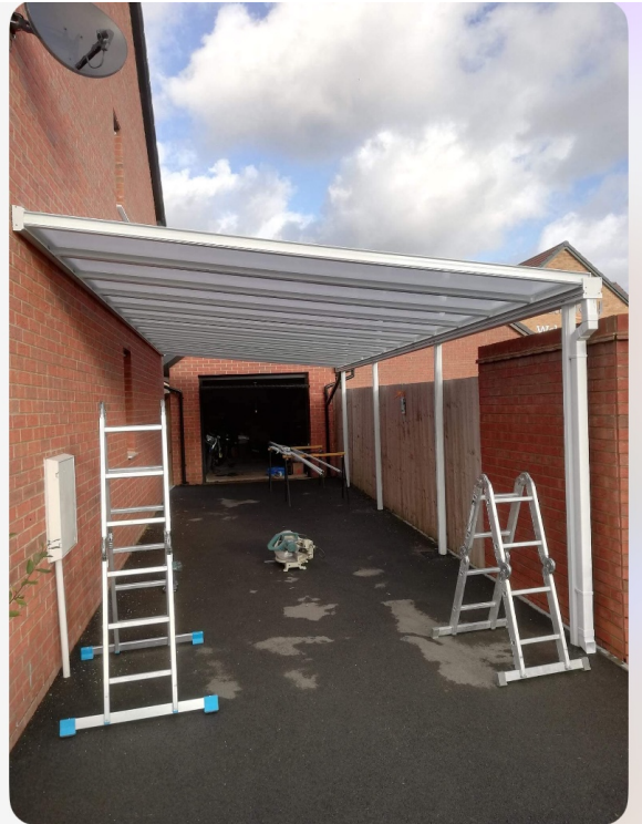
Example from company that is supplying and fitting car port