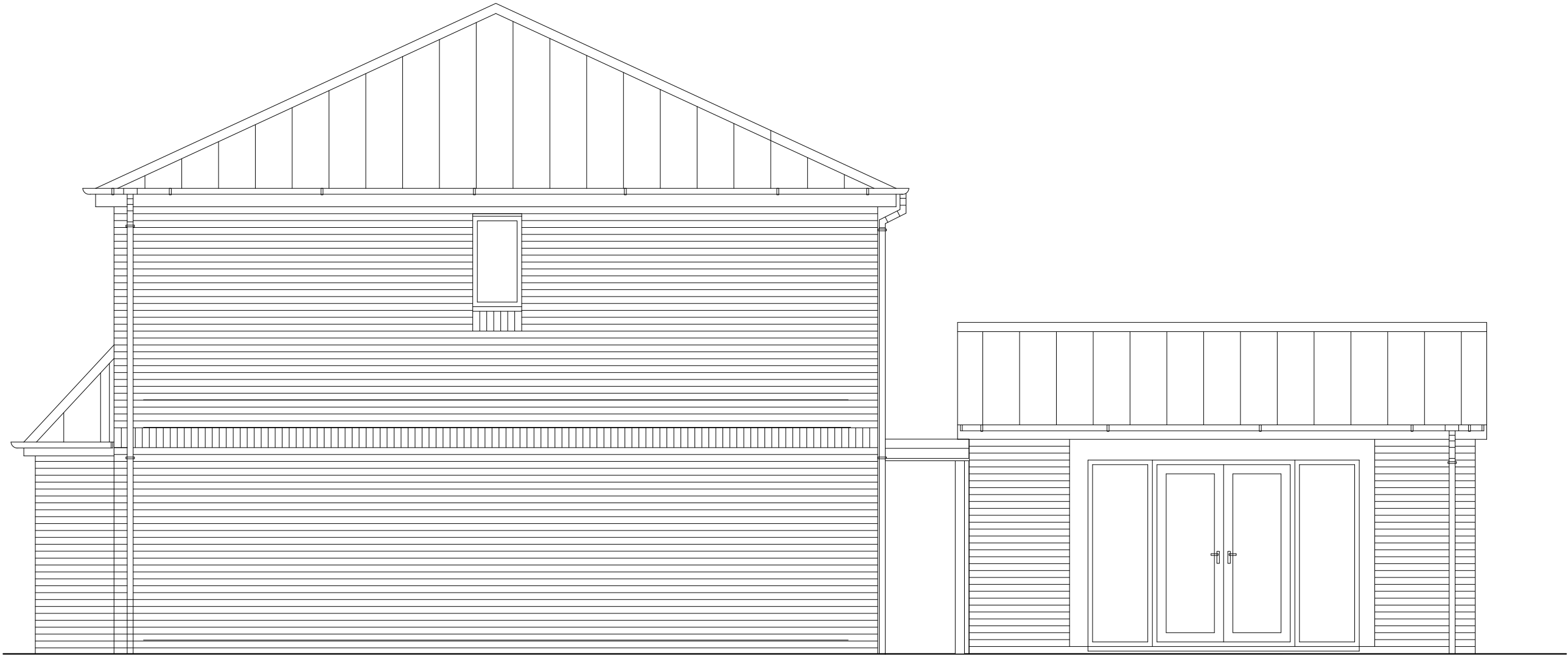
Existing Elevations Side