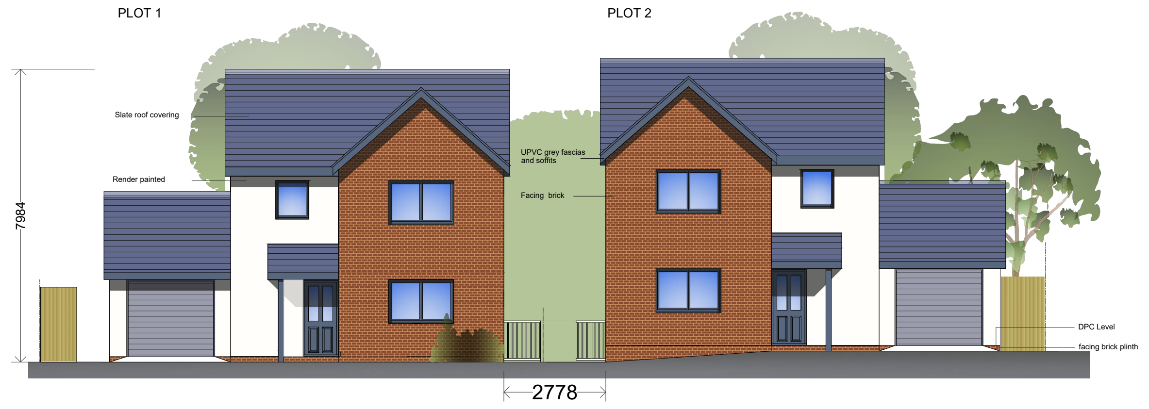
PROPOSED SIDE ELEVATION - PLOT 1

SCHWEGLER Swift Box 1MFS (No 16) fixed to external wall of building